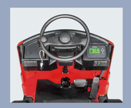
Modern outline design with LCD instrument and USB charging po