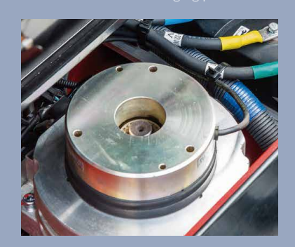
Electrical Park Brake (EPB) syste