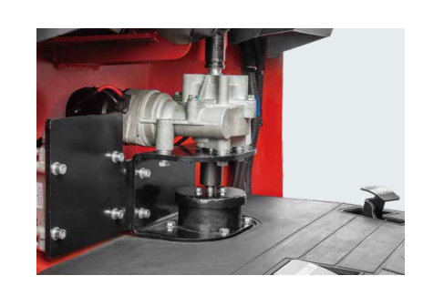
Electronic power steering system (for stand-up driving type tractor)