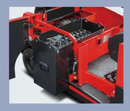
Battery side roll out is taken as the standard configuration in order to easily and fast replace the battery