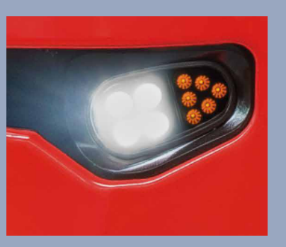
Reliable LED lighting