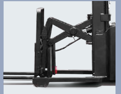
Forks move forward by the scissor structure