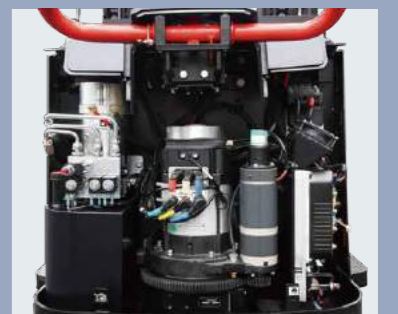
Back cover can be opened fully