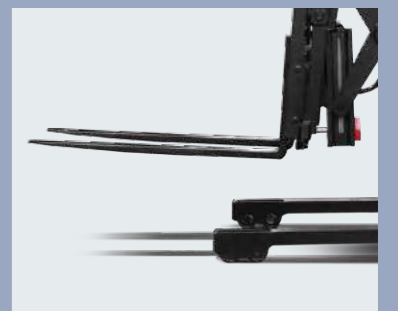
Proportional controlled forks can be operated more accurately